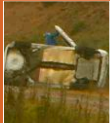
"I was holding the door for her - honest"