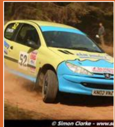
Dale Owen in better shape